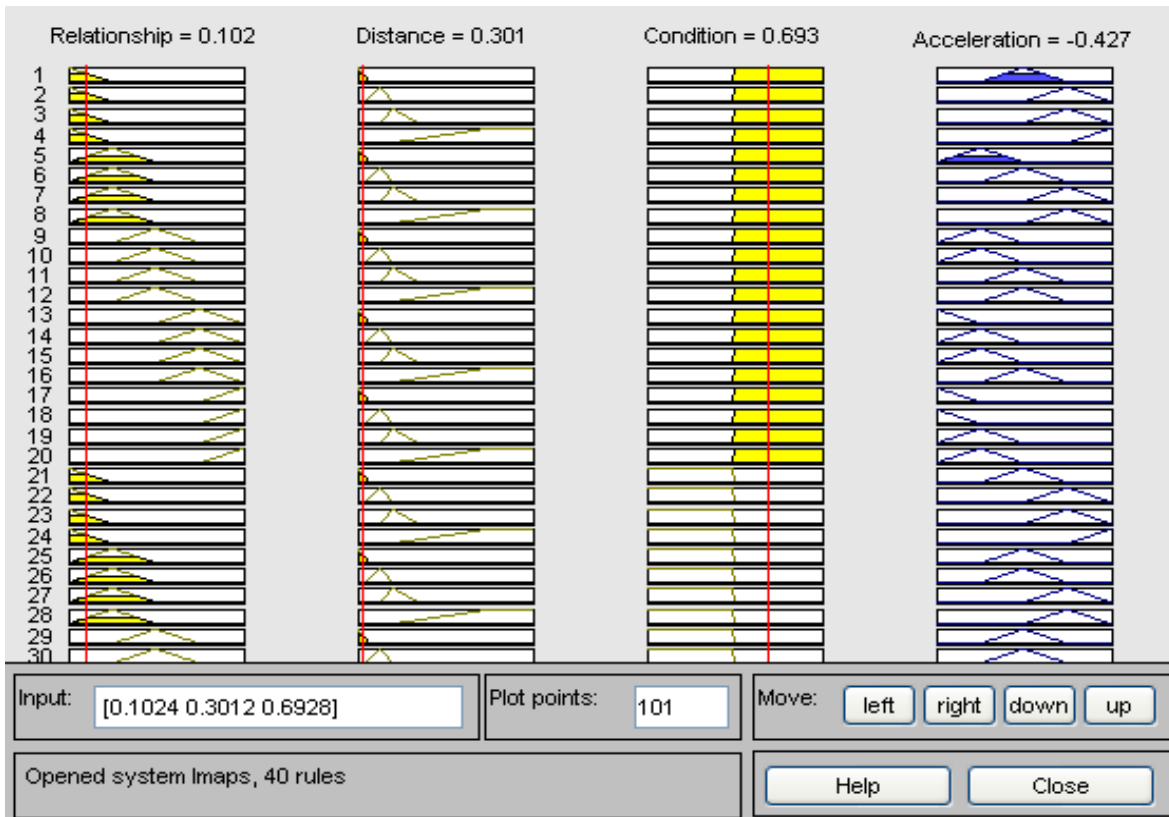
Figure 4. Fuzzy Simulation